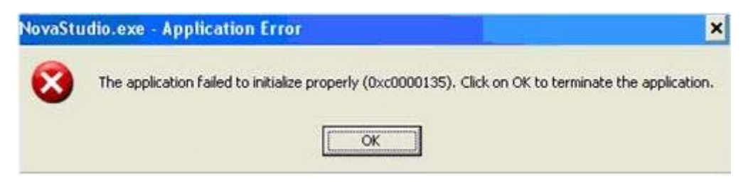
Fig.1.2 error message

Please make sure that Microsoft.NET Framework 2.0 has been installed in the computer if the error message in Fig.1.2 shows up when running NovaStudio2012. Microsoft.NET Framework 2.0 is required for running NovaStudio2012.